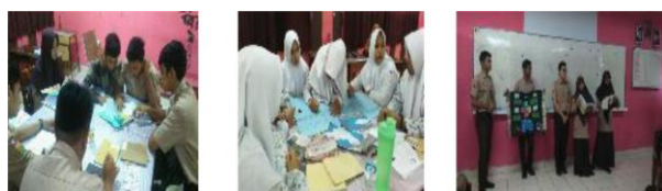
(i) (ii) (iii) Figure 2. The implementation of pop-up on colloids: (i) students observed the pop-up, (ii) the group work prepared the presentation materials, and (iii), students presented the results of group

Based on observations, there were 13 (thirteen) students with very good category of activities, and 12 (twelve) students in good category, the other 6 (six) students in enough category. Overall, percentage of students' activities was equal to 76.21 percent and fallen into good category. Fig. 3 shows the learning activities of students. There was an increase in the activity of students found in studying colloidal material using pop-up book. The highest type of activity observed was visual activities, and the lowest percentage of activities was found to be mental activities. It might be due to the limited time of learning, so that not all students had time in responding the discussion. However, overall students still had good activities because in group discussions some students were appeared to be actively advised and there were some students in the group who were lacked in group discussions. This also might be due to during the learning process taken place, students look very enthusiastic and motivated in following the learning process.