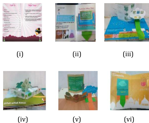
Figure 1. Developed Innovative Pop-up Book: (i) Table of content, (ii) page of colloidal definition, (iii) page of the colloidal types, (iv) page of colloidal properties, (v) the role of colloids page, and (vi) the conclusion page

c) The development of assessment instruments. The validation of pop-up book was assessed using questionnaire sheet and the students' activities were assessed using observation form. d) Validation of pop-up book. Validation aimed to assess the feasibility of the pop-up book. The feasibility of pop-up book on colloids material obtained from the expert validators. Based on the results