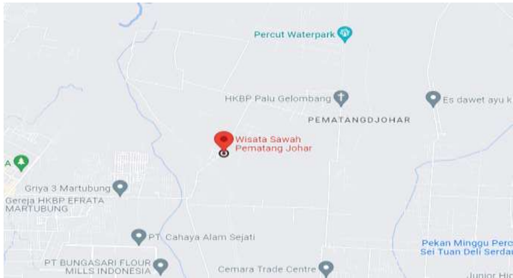
Figure 1. Google Maps Research Site

microbiology testing was carried out at Medan Regional Health Laboratory (Labkesda).