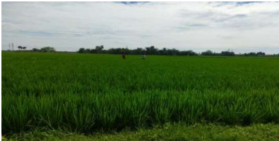
Figure 2. The condition of the rice fields in the research site

The tools used in this study include digging tools such as earth drills, hoes, shovels; measuring devices such as tape measure and ruler; AAS instrument to measure total P and K levels; Walkley and Black with Spectrometer for organic C measurements; pH (pH H 2 O) by means of